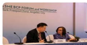
EPWG Co-Chair & DTI Undersecretary