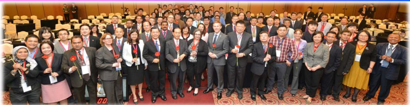
APEC High Level Policy Dialogue Joint Statement on Resilient SMEs for Better Global Supply Chains