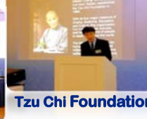
Tzu Chi Foundation