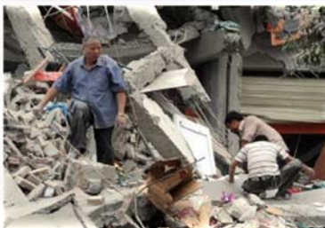
Earthquake China, 2008