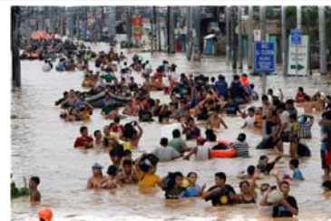
Typhoon Philippines, 2009