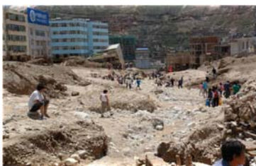
Debris flow China, 2010