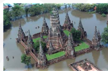
Flood Thailand, 2011