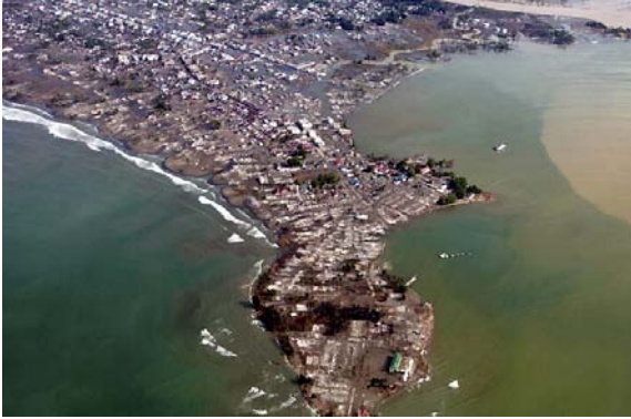
2004 Indian Ocean Tsunami