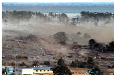
Earthquake & Tsunami Japan, 2011